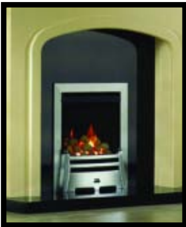
MATCHLESS HEAT MACHINE

High efficiency fires are glass fronted appliances and because of this when the fire is not switched on you do not lose any of the warmth from the room as it is unable to be sucked in to the chimney or flue system. Also with high efficiency fires the glass front remains cleaner for a much greater length of time.