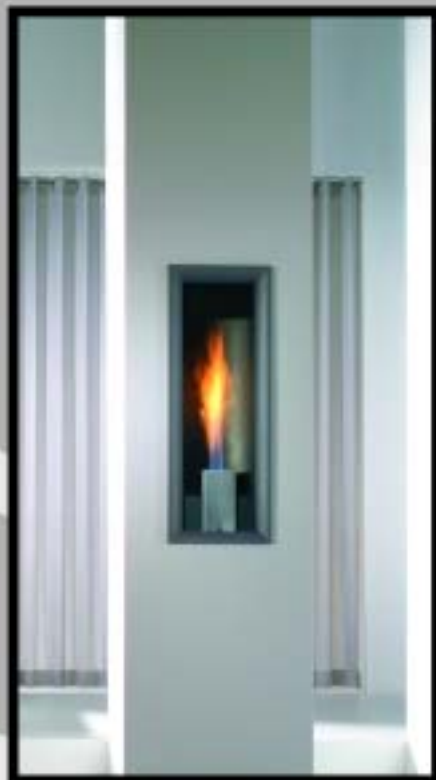
The Torch Framed

As the name suggests there is no chimney or flue system required. They are 100% efficient giving maximum heat for minimum running costs. Very modern looks and effects. Specific room sizes and air vent required.