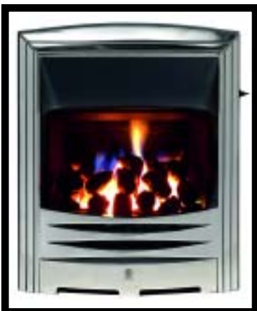
SOLARIS HIGH EFFICIENCY FIRE

High efficiency fires are glass fronted appliances and because of this when the fire is not switched on you do not lose any of the warmth from the room as it is unable to be sucked in to the chimney or flue system. Also with high efficiency fires the glass front remains cleaner for a much greater length of time.