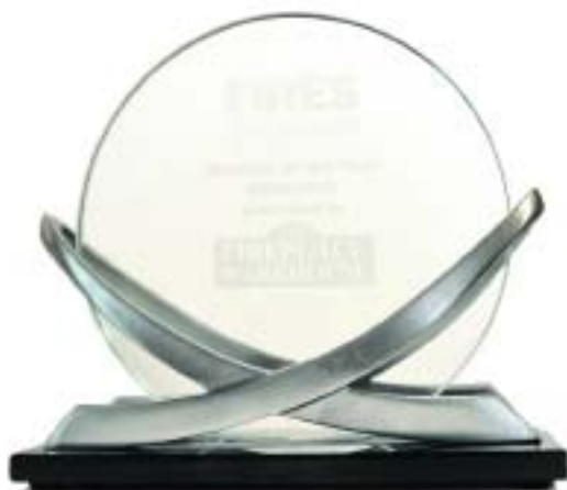
"Retailer of the Year Award"